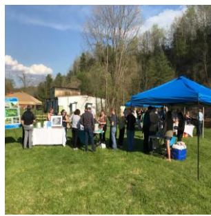
Business After Hours held at Cascade Mills Falls.