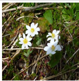
Early spring blooms sighted at the Walk on the Wildflower Side FOTO Event .