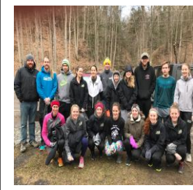
Spring Cleanup – Keuka College students “ plogging ” on the Trail.