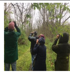
Ah, spring. What better time to go outside and celebrate the return of migratory birds? Birders at the FOTO Early Morning Birding Event .