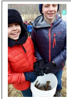
Marcus Whitman students assist the DEC in stocking fish in the Outlet Creek.