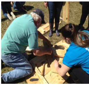
New picnic tables for the pavilion at Cascade Mills Falls are assembled with the help of volunteers during Celebrate Service, Celebrate Yates .