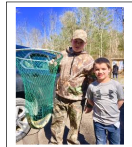
A Spring catch from the Outlet Creek!