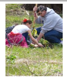
Penn Yan Elementary students celebrate Arbor Day planting trees along the Keuka Outlet Trail.